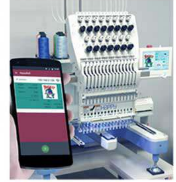
HAPPYBELL Application For monitoring machines wirelessly on mobile devices