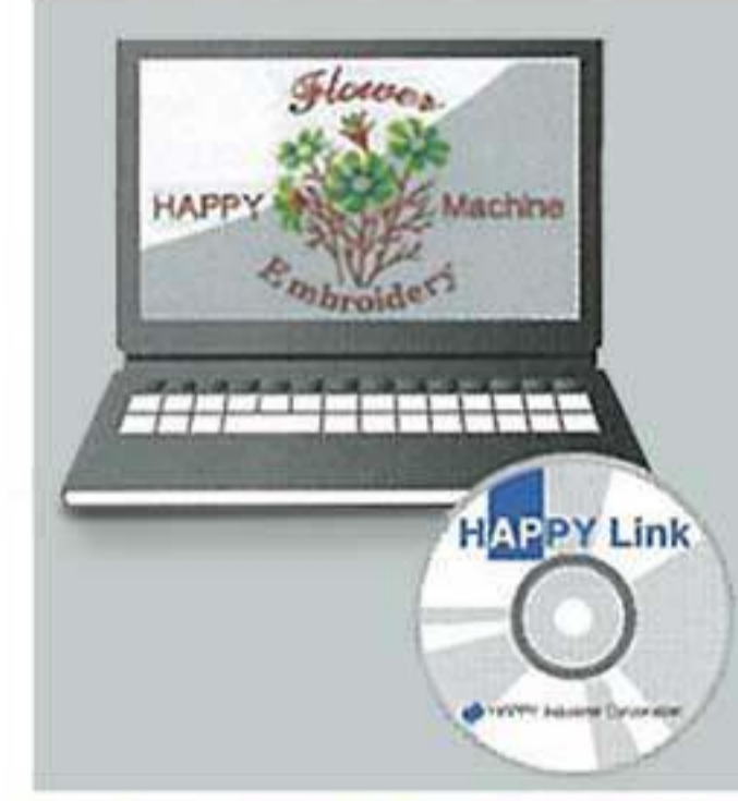
Included HAPPYLINK & LAN Machine networking, design transfer and editing software