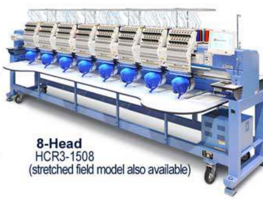
8-Head HCR3-1508 (stretched field model also available)