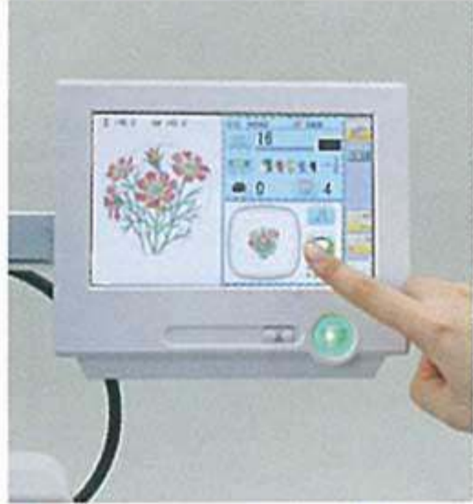
Touchscreen Control Panel Memory capacity: 999 designs/ 40 million stitches. Auto-error correction