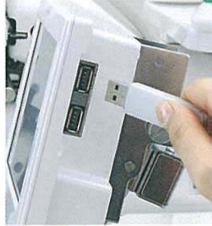
Dual USB Ports Accept most brands/capacities of USB thumb drives, USB mouse