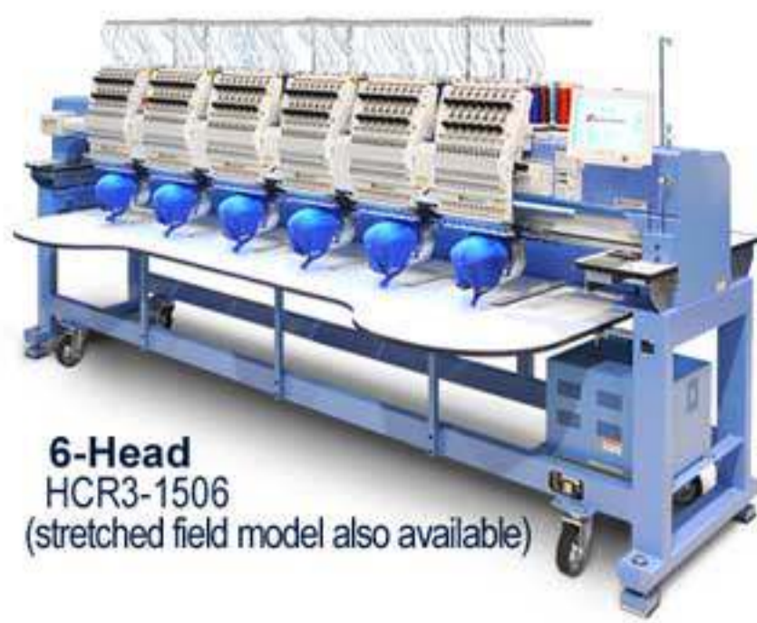
6-Head HCR3-1506 (stretched field model also available)