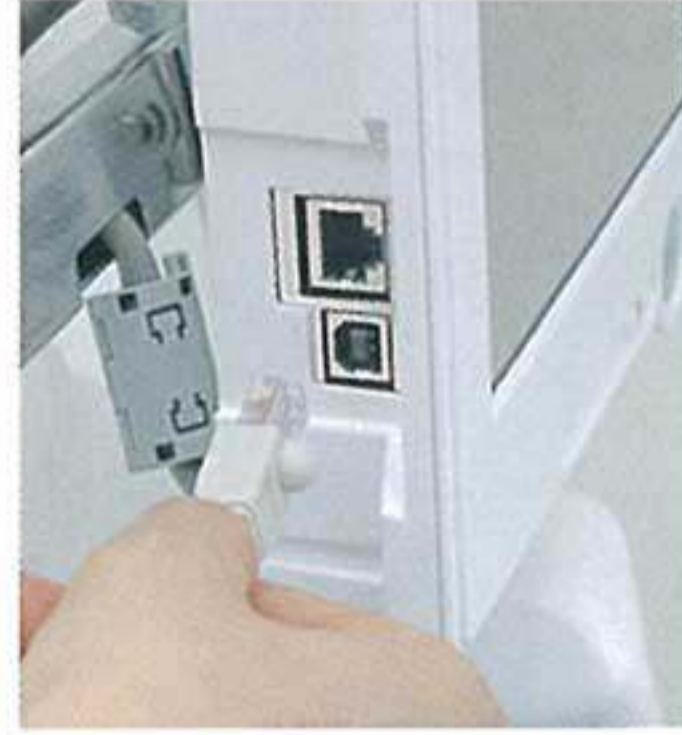
LAN/USB Connection Ports For optional live PC connection for design transfer/setup/management