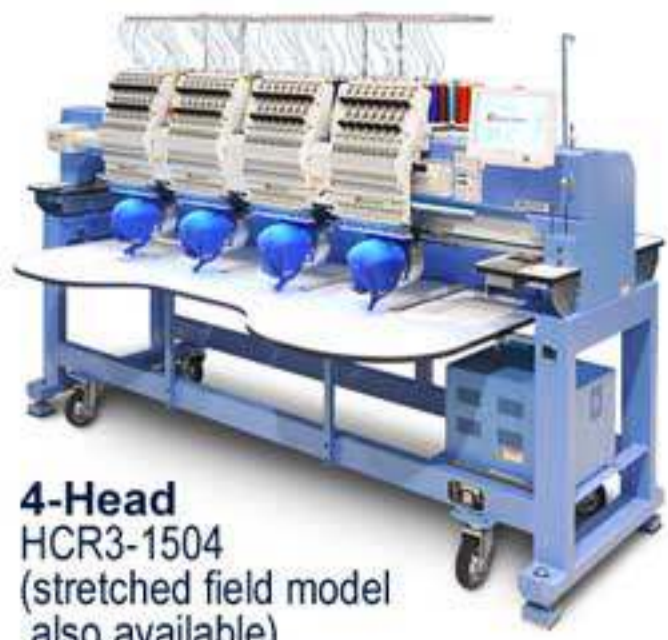
4-Head HCR3-1504 (stretched field model also available)